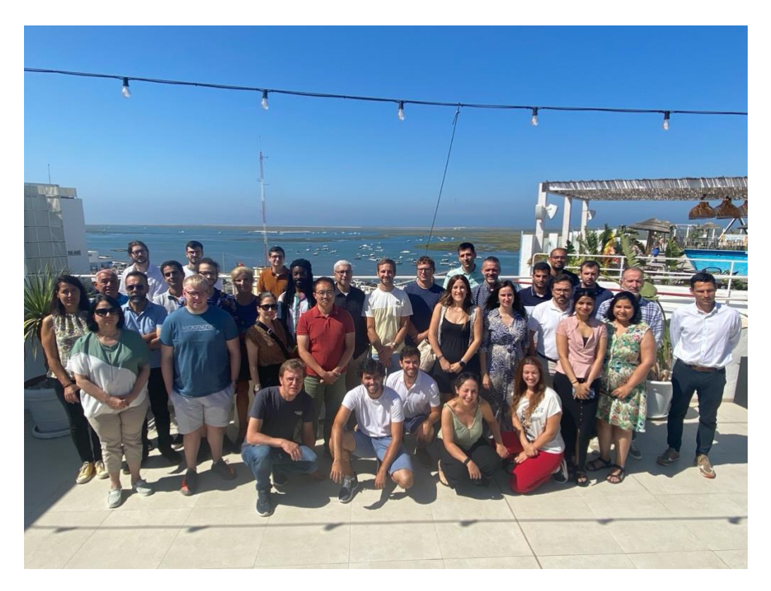
The microalgae researchers, agricultural producers and technology experts of the REALM project at their first project meeting at the beginning of July in Faro.